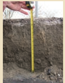
PR600C's power makes 14 in (355 mm) deep plunge cuts easy.