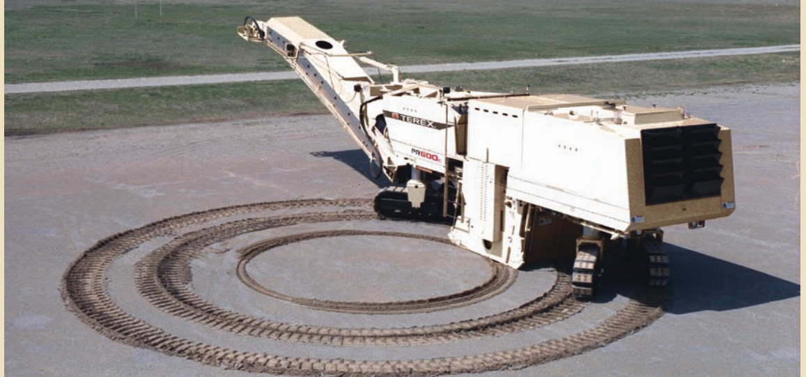
The PR600C's four-track stance gives it an 8 ft (2,438 mm) turning radius.