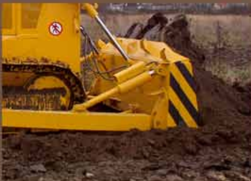
Semi-U blade of 4.28 m 3 (5.6 yd 3 ) (STD)