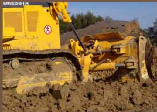
6-way hydraulic angle blade of 3.2 m 3 (4.2 yd 3 ) (STD & LT) and 3.8 m 3 (5.0 yd 3 ) (LGP)