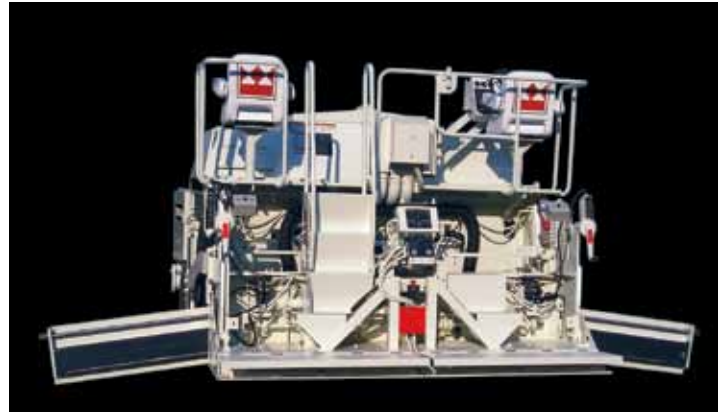
▪ Fastach Fixed-width Screed

The Fastach 10 screed is built to handle any paving application, offering widths for the CR400 Series pavers from 10 to 28 ft (3.0 to 8.5 m) with quick mounting extensions. Available hydraulically extendable strike-offs and screeding blades extend base screed width by 4 ft (1.2 m) on either side, giving you up to an 18 ft (5.5 m) base paving width.